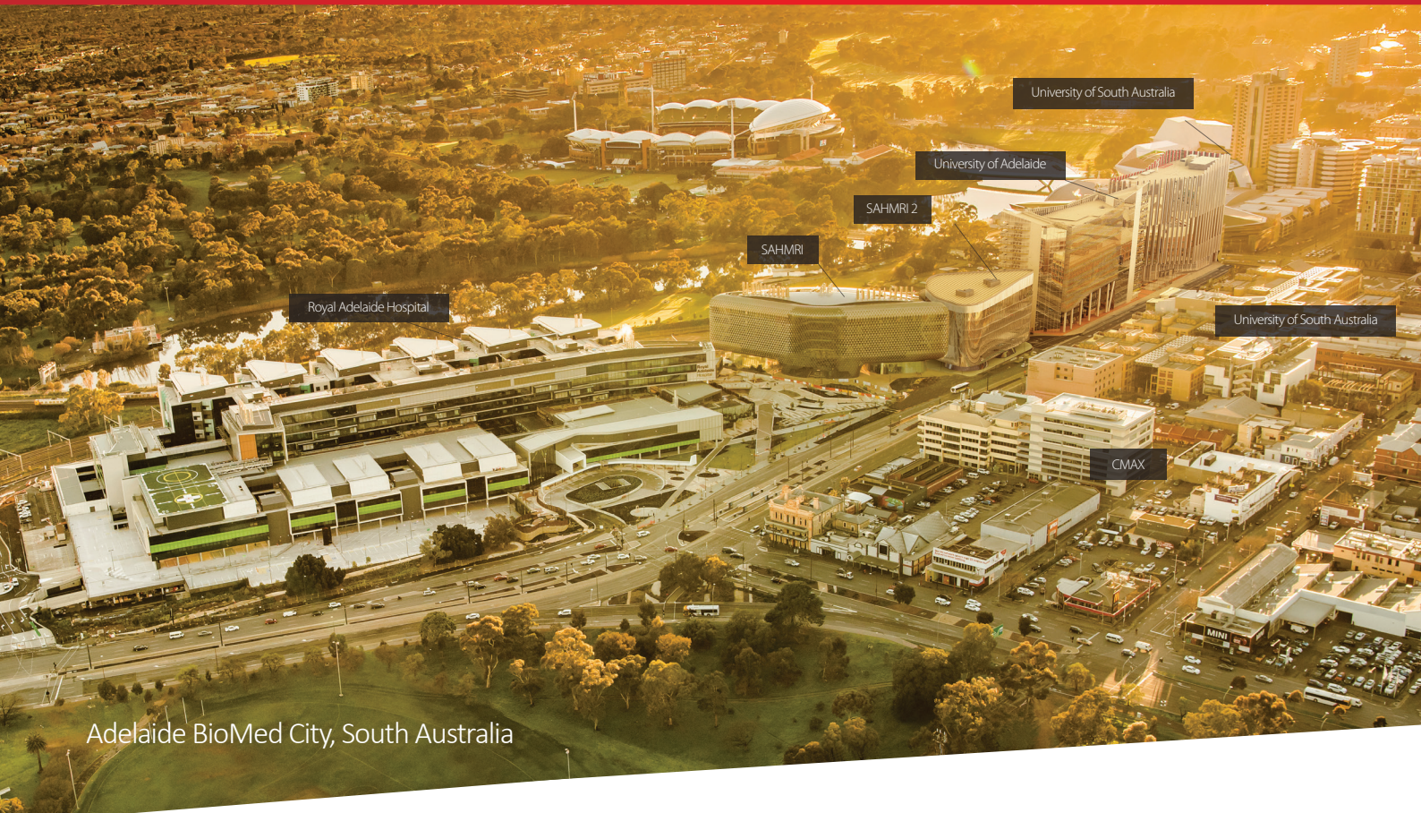
Adelaide BioMed City, South Australia

Please join us for a roundtable discussion about the life sciences ecosystem in Australia, including Adelaide BioMed City