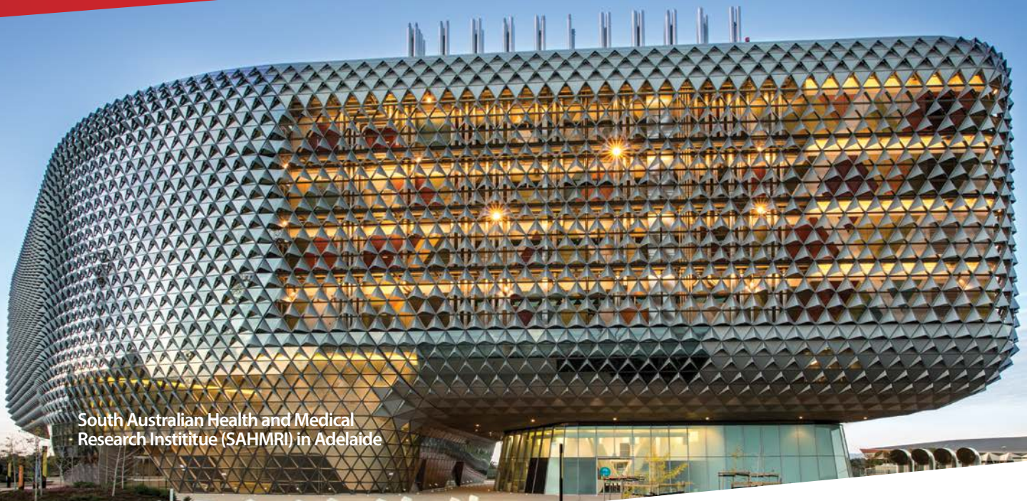
South Australian Health and Medical Research Institute (SAHMRI) in Adelaide

The South Australian Government is offering European companies a unique opportunity to learn about Australia and Adelaide's fast-growing life sciences ecosystem.